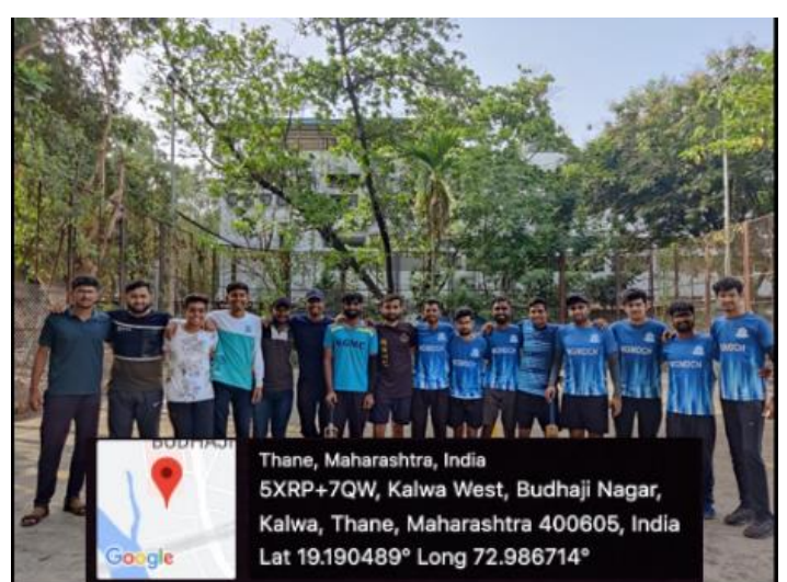
MGM Dental College and Hospital's Football and Cricket team for the event